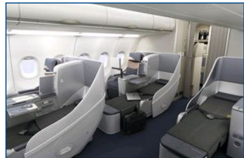
Shown above is the 2x2 arrangement of the lie-flat beds in a specially configured Airbus A318.

The service was designed to offer particular appeal to corporate travelers based in London’s financial district, which is adjacent to the airport. Unfortunately, the September 2009 launch of the service could not have been more problematic due to the global recession; London’s banking and insurance industries have been particularly punished. The carrier had lingering doubts about the concept; Willie Walsh says management considered canceling the project on at least two occasions, with the last review occurring June 2009. 19