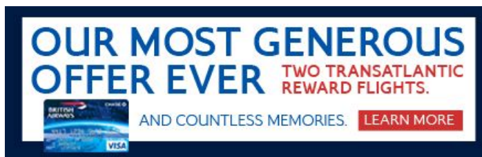
The above offers were promoted at BA.com during December 2009.

The complimentary companion ticket offer announced in September 2008 was critiqued by the Wall Street Journal as being “so complicated that it offers a vivid example of the complexities often involved in airline specials.” 25 The article went on to describe some of the 29 different items listed under “Terms and Conditions.